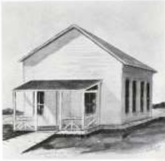
Little Chapel on the Boardwalk circa 1910