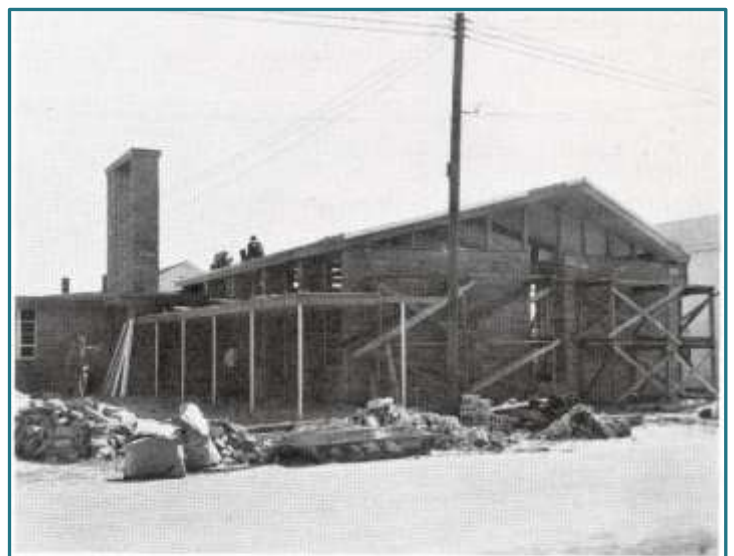
"The Chapel under construction" in 1951

Work began in February and the first service was held in the sanctuary in August.