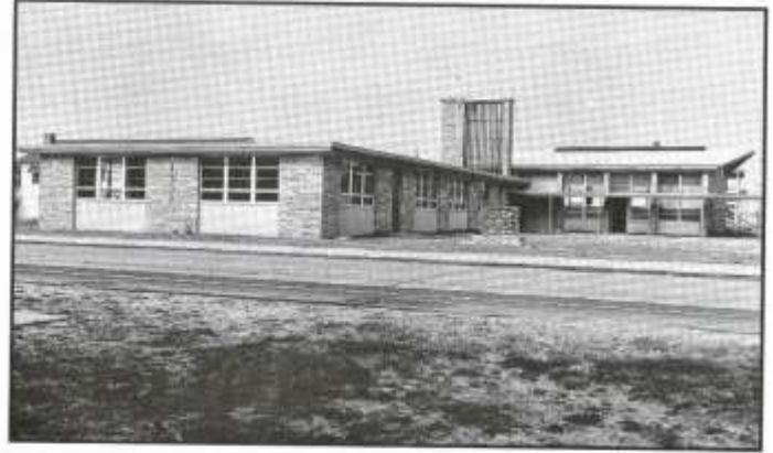
1955 Little Chapel's new Fellowship Hall and Sunday School space needed to accommodate an attendance of 200 to 300 persons.

As the number of members grew, the first renovation to ease overcrowding took place in 1955.