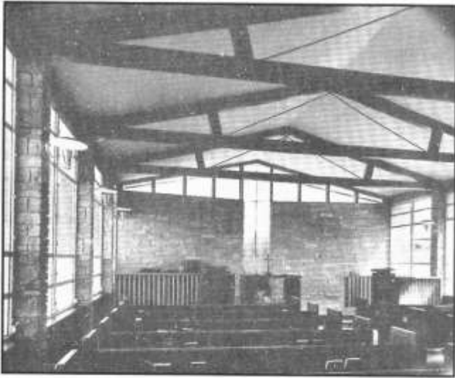
1951 Completed Little Chapel Sanctuary and Chancel Wall.

Two classrooms were added as well as the Manse.