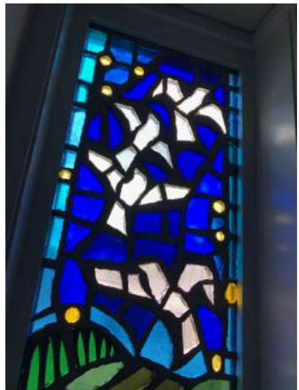
Stained glass photos courtesy of Lori Holcomb