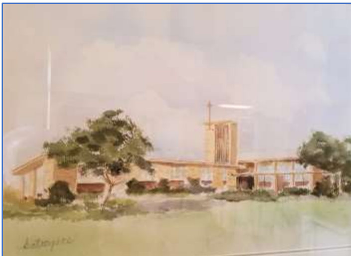
The fourth watercolor done by Kay Marshburn reflects the 1984-85 expansion which was dedicated on January 20, 1985.