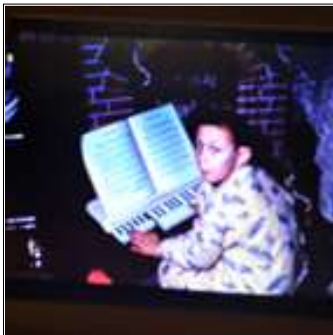
at 10 years old at the organ