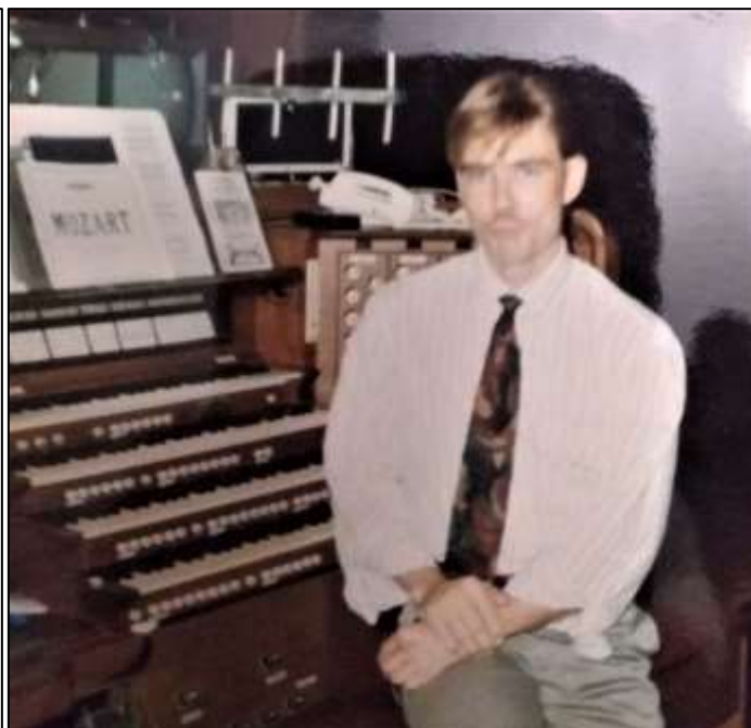
at an organ recital at the Immaculate Conception Basilica in Washington, D.C. in 1991