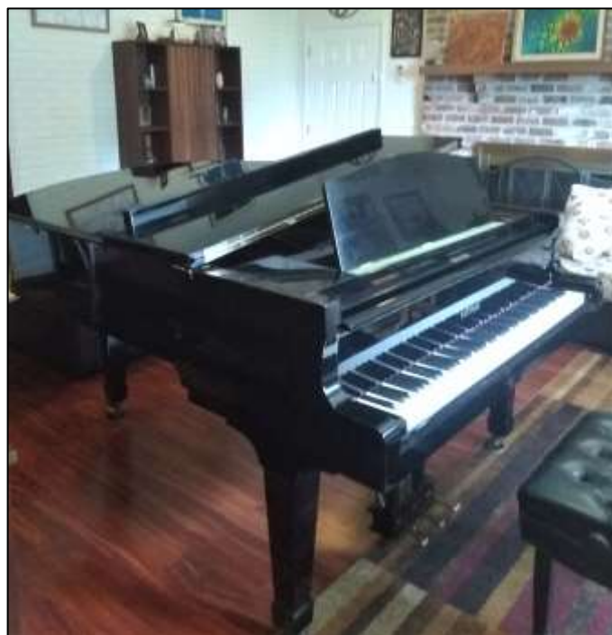
The grand piano

When asked what his future plans were, he said, “to retire...eventually...not entirely.” With a beautiful grand piano, organ and harpsichord in his residence, it would be hard to image this brilliant, talented musician ever retiring from his life’s work.