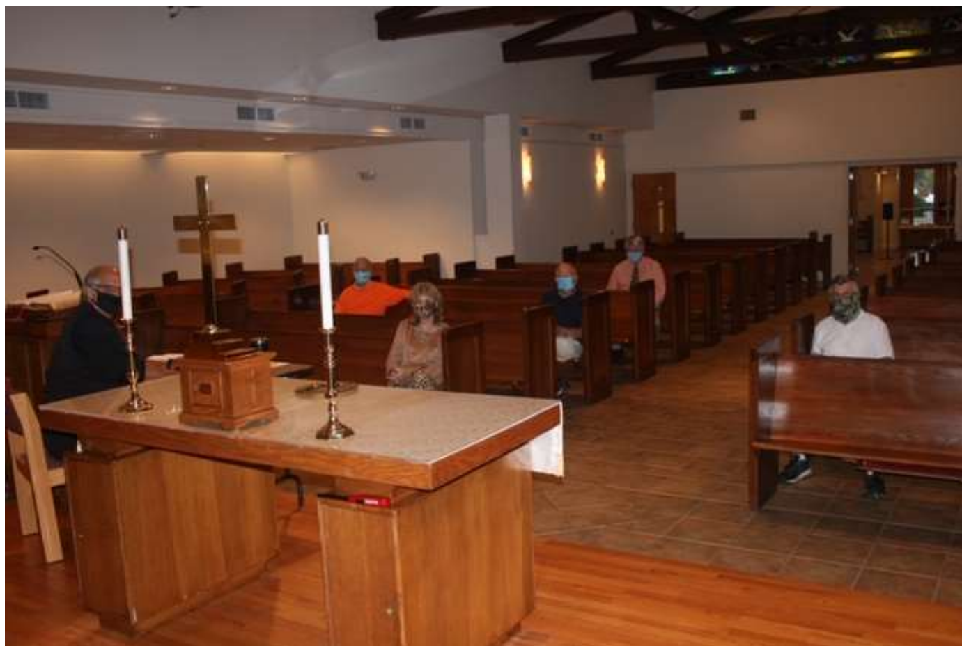
The Property Committee practiced social distancing while meeting in the sanctuary October 25

Well, once again as you can see, it has been a very busy month. On top of all the projects, our Property Committee (and all committees) have had to provide input to our 2021 budget. Unlike the remote-controlled dune buggy stump removing machine , the budgeting effort is definitely not as fun!