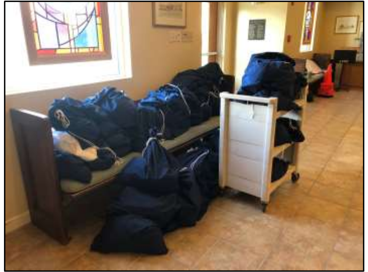
Forty-seven duffel bags waiting to be picked up