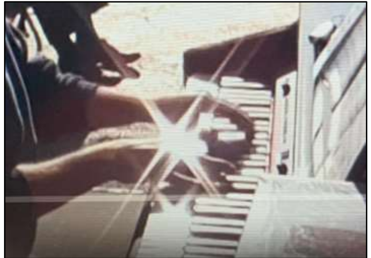
Then there was the magic of the sun's reflection dancing on the keyboard during a recent outdoor service