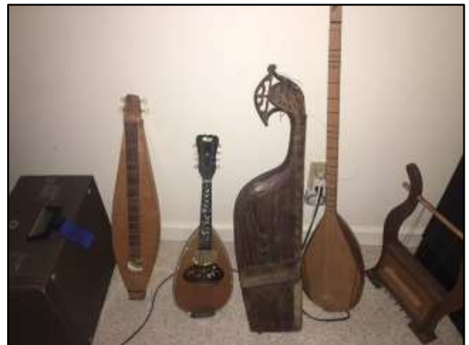
Variety of Folk instruments from various countries