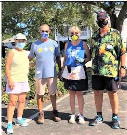
The pictures which follow were taken during the Saturday, October 24 landscape work day. Many thanks to all those who volunteered their time and efforts.

I hope we all can have the opportunity to have a Thanksgiving filled with family, friends, and prudent safe precautions as we gather together. Our prayers are with all those who are struggling as we approach the Holiday seasons – hopefully, we can “brighten” up our property and the spirits of those who can visit us on Sundays.