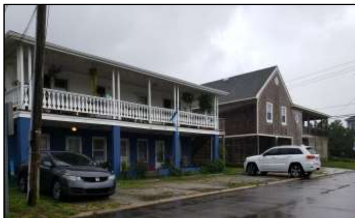
Peggy's apartment complex and current house on corner

Peggy and her late husband, Clyde, moved into an apartment on Wrightsville Beach in 1954. In 1955, they bought the four-apartment complex and the lot next door.